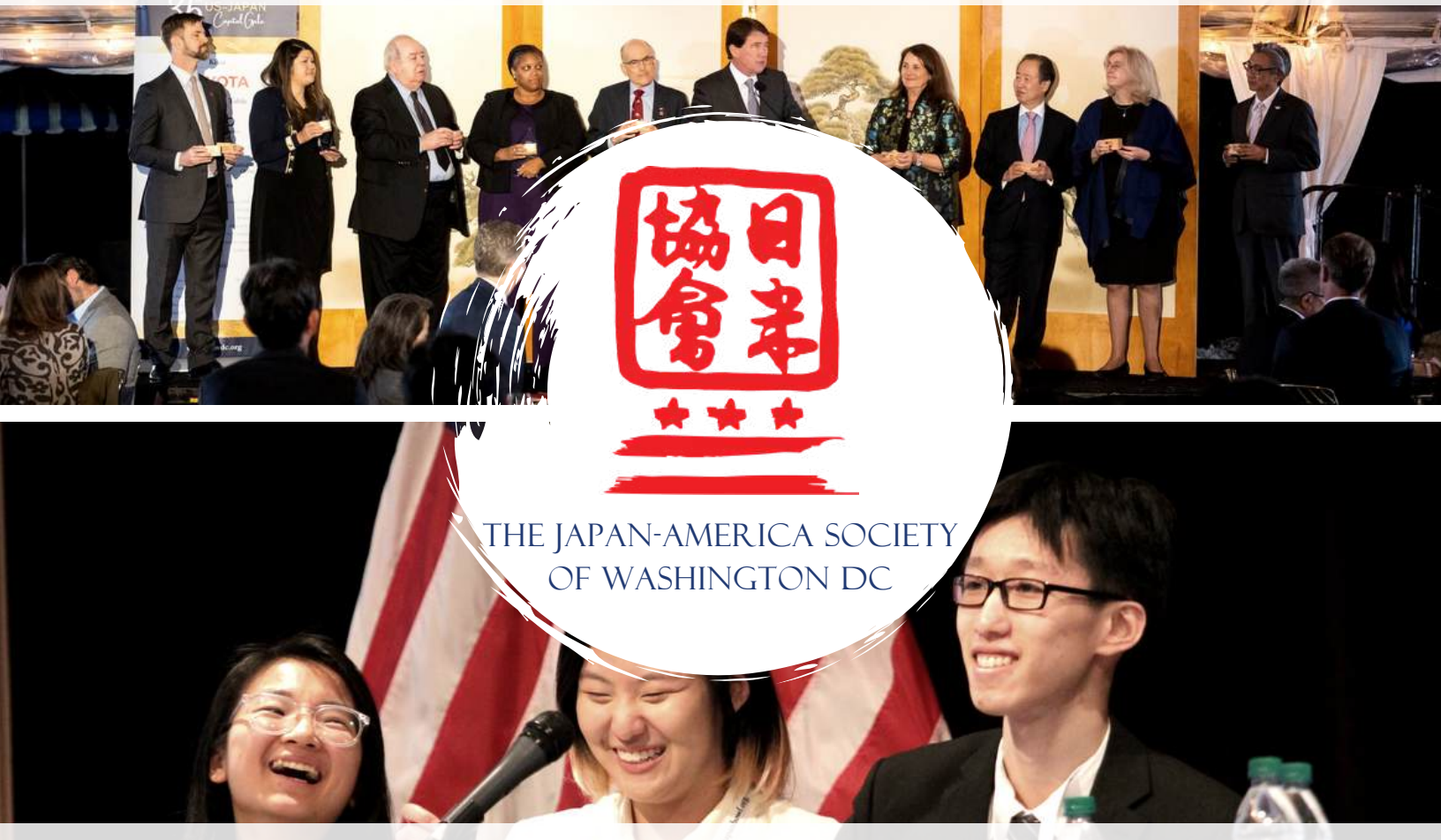
JAPAN BOWL: America's national Japanese language competition