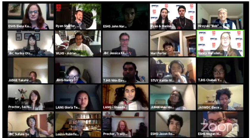
Announcement of finalists for the Digital Japan Bowl