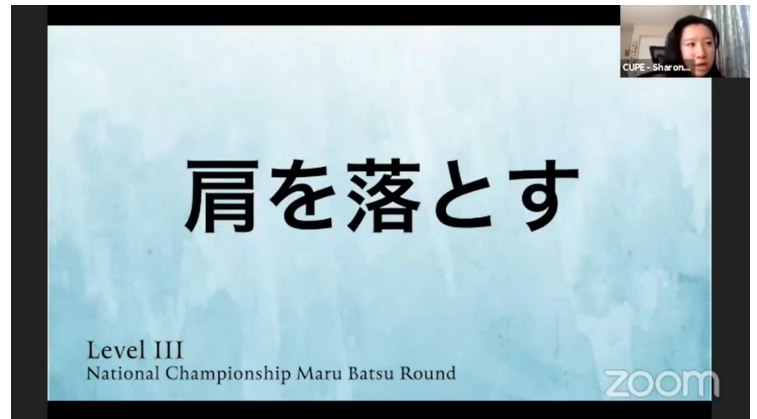
Level III Championship Round