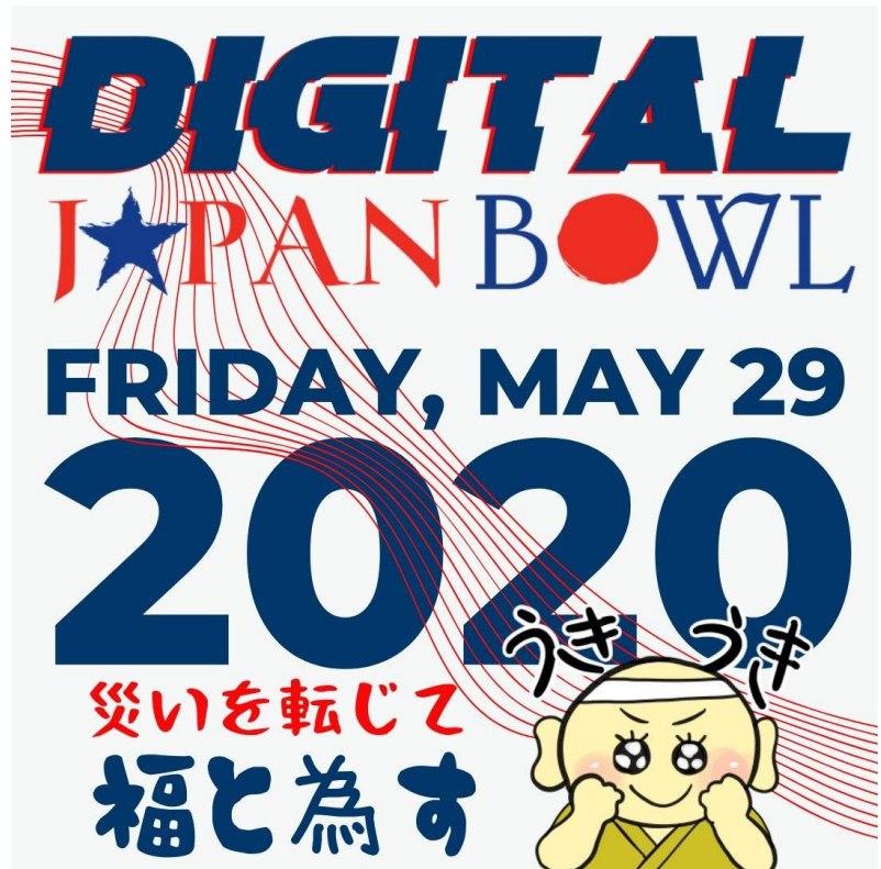
Digital Japan Bowl Promotional Poster