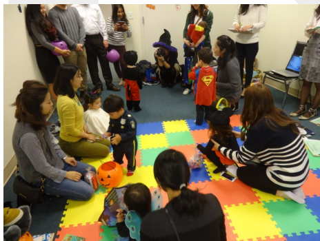
Ohanashikai volunteers and staff celebrating Halloween.