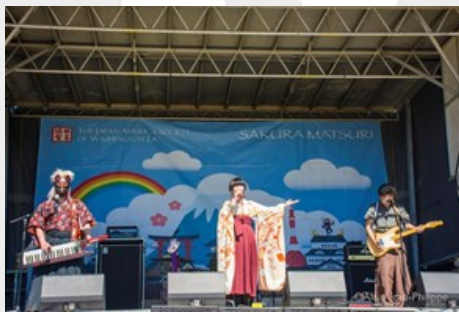
57 th Annual Sakura Matsuri