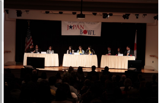
2017 National Japan Bowl Final Round